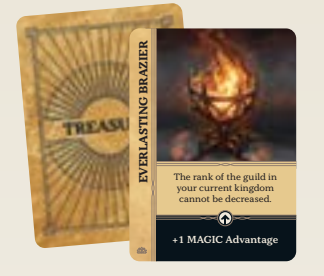
20 new treasures