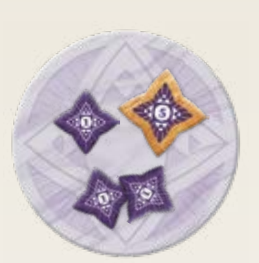
Hero pool (influence vessel)