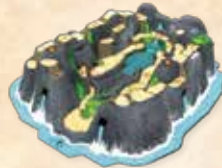
1 Peninsula tray