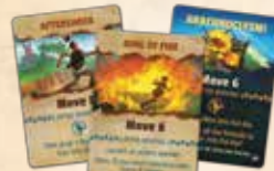
10 Action cards