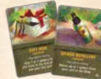
4 Souvenir cards