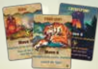
13 Action cards